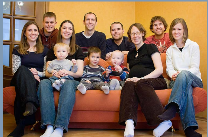
Kharkov Church Planting Team

Please let us know if you or somebody you know can help out!