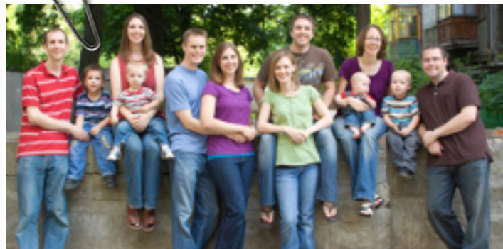
Kharkov Mission Team