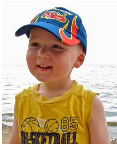
Maximus - 6 months old now!