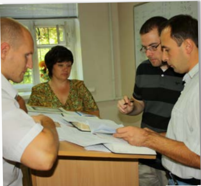
TEACHING AT UBI