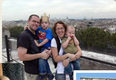
Our family in Rome, for our visa renewal trip