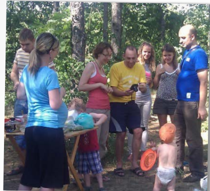
FELLOWSHIP AT THE PARK