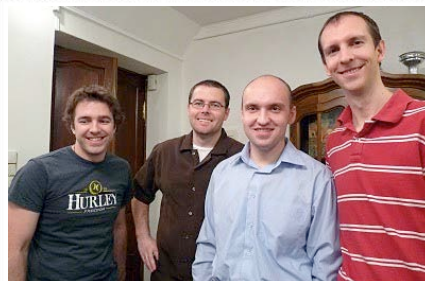
After the Baptism